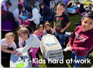
K-Kids hard at work