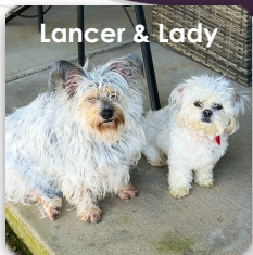
Lancer & Lady

InterWest Insurance of Merced has an annual program called "InterWest Gives Back." Every year each office selects four local charities, one for each quarter, collects goods and submits checks to all. Word is, New Beginnings is one of the choices every year! Everyone on the staff confesses to be an ardent animal lover and the enthusiasm is palpable. Thanks so much, InterWest! We feel honored that these groups think the work we do is worthy of their support. That's how we're able to do so much in the way of medical treatments and rehoming—by people trusting us to meet the needs of animals to the best of our ability.