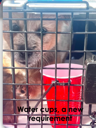
Water cups, a new requirement