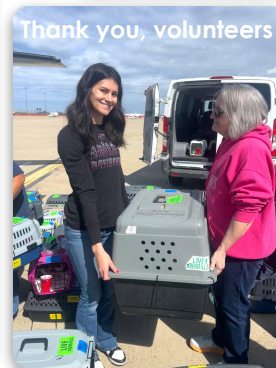
Thank you, volunteers